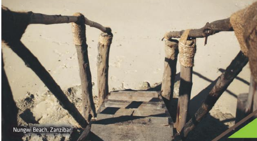
Nungwi Beach, Zanzibar

CBA congratulates Davis & Shirliff Group on their 70th Anniversary.