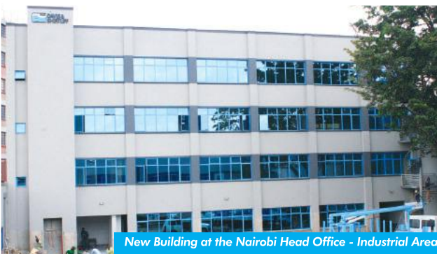
New Building at the Nairobi Head Office - Industrial Area