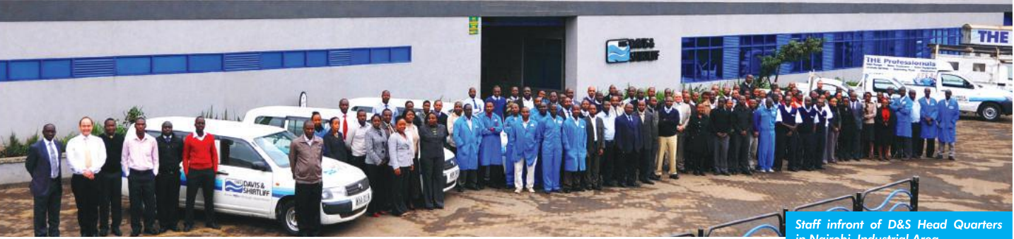
Staff in front of D&S Head Quarters in Nairobi, Industrial Area