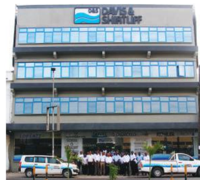
A view of the newly opened Mombasa head office.

In this internet driven age of universal information product differentiation has become increasingly difficult to achieve, which has been a great benefit to the consumer in terms of much reduced pricing. The key market differentiators