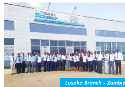
Lusaka Branch - Zambia

+254 737 557755 ramcoprinting.com RamcoPrintingWorksLtd