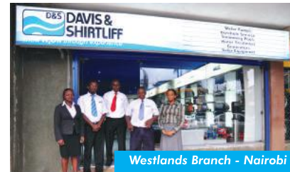
Westlands Branch - Nairobi

In order to better co-ordinate resources, the company has invested heavily in its IT infrastructure with a real time centralised ERP system being used regionally and with all system development being done