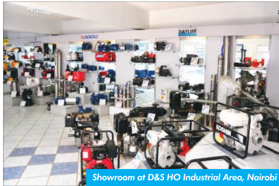
Showroom at D&S HO Industrial Area, Nairobi

Certikin and Midas plus a range of locally manufactured items. The strategy has been most successful and Davis &