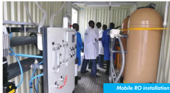
Mobile RO installation

As well as unparalleled functionality and convenience for the user, innovative monitoring systems like iDayliff allow D&S engineers to minimise equipment failure more effectively through preventative maintenance and rapid response. Customers choosing a D&S service contract with iDayliff will have their equipment monitored 24hrs/day so that should a failure occur, a maintenance team can be despatched even before the fault becomes evident to the user. Similarly, should the system detect any anomaly, maintenance can be scheduled to avoid any catastrophic failure in the future.