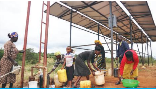
Dayliff remote monitoring solar powered borehole pump installed at Mwala

Despite its long history and market maturity Davis & Shirliff today is a technology focused company with a strategy of winning Leadership through Technology . This recognises its deep technical capacity with no regional organisation employing more qualified engineers, the opportunities available with modern digital technology and the fact that many of its products are essentially commodities and customer value can be created through technological innovation.