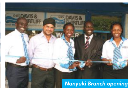
Nanyuki Branch opening