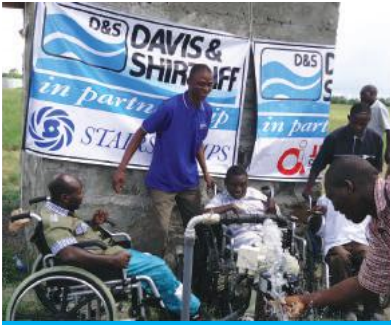
Borehole installation at Handicapped Community Fellowship Ministry

For any company or individual who achieves a degree of success and prosperity, there comes an equal measure of responsibility and a duty to give back to the society to which they belong. For Davis & Shirliff this is an important priority and for many years it has had a CSR programme of assisting needy institutions with donated water and energy solutions, it being estimated that over one million people have benefited. This is organised by a volunteer staff committee who put in considerable time identifying and executing projects and for