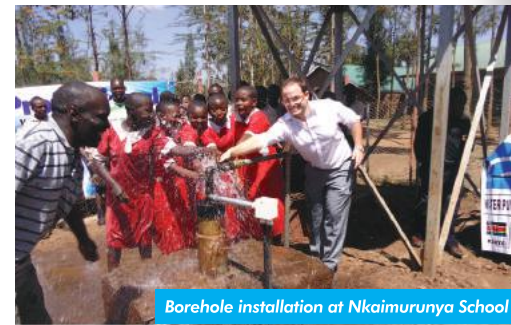
Borehole installation at Nkaimurunya School

much can be achieved with relatively small investments, the provision of accessible and safe water supply making such a huge impact on people's lives. By working together with its various partners, Davis & Shirliff has already made a considerable contribution and is determined to increase its community activities in the future.