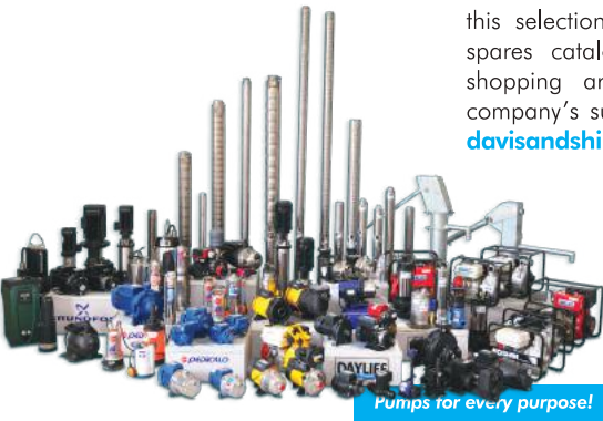
Pumps for every purpose!

this selection tools, technical data and spares catalogues as well as internet shopping are all available from the company's substantial online presence at davisandshirtiliff.com and dayliff.com .