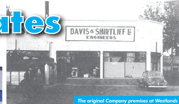
The original Company premises at Westlands