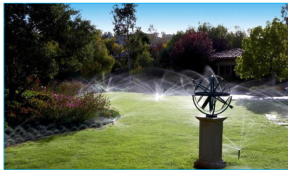
Hunter high efficiency pop-up sprinklers at work.

Headquartered in San Marcos , California and founded in 1981, Hunter is a world leader in irrigation solutions for residential, commercial, and golf course applications. With a product range that includes pop-up gear-driven rotors, high-efficiency rotary nozzles, spray sprinklers, valves, controllers, central controllers, professional landscape drip, and weather sensors, Hunter offers a complete portfolio of innovative irrigation products.