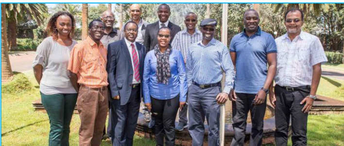
The D&S Executive team pose after a successful team building activity held at Windsor Golf and Country Club.