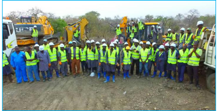
The D&S Uganda site team with their equipment ready for a hard day's work installing one of the solar water systems for DRC in the Arua region.

D&S Uganda has developed a unique expertise in the supply and installation of large solar pumping projects and has successfully installed a number of installations. It has a full pipeline of projects in hand and is currently engaged in the installation at seven sites in the Arua region of NW Uganda for the Danish Refugee Council in support of the massive influx of refugees from South Sudan and DRC in that area. The installations involve pumps, solar arrays, water distribution and infrastructure to provide complete water supplies and the team have a unique military style work ethic applying a large workforce plus extensive mechanisation to complete complex installations in a few weeks. The success of this approach has greatly impressed the clients and also proved the effectiveness of solar pumping in remote areas. It is expected to be a source of regular business for some time to come!