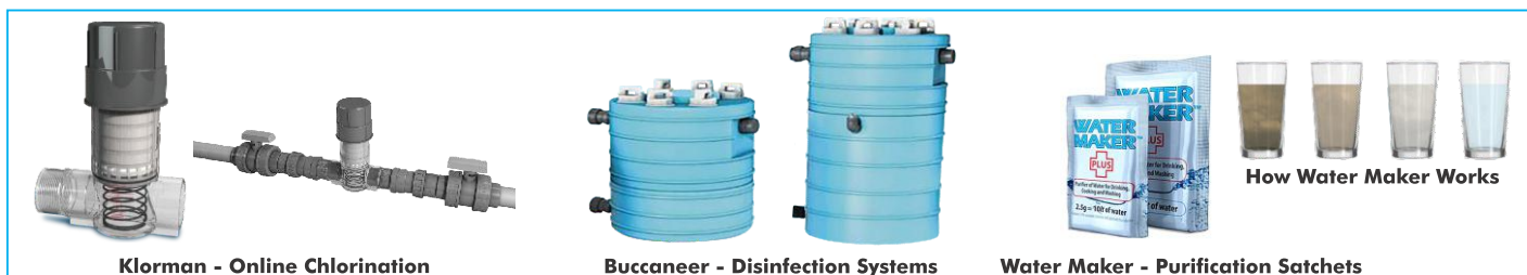
Klorman - Online Chlorination