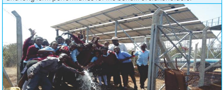
Students of Twale secondary school are pictured enjoying water from one of the Meru County solarised borehole water projects.