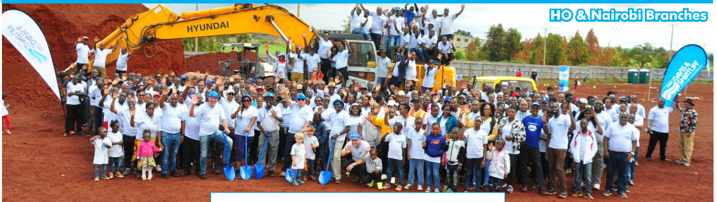
HO & Nairobi Branches