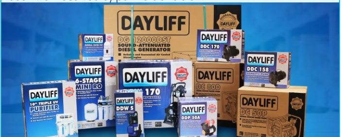
A view of the new look Dayliff packaging.

Dayliff as a brand can trace its origins back to the 1970s when it was used to label various engineered systems produced by D&S and since then has steadily developed into the company's comprehensive own-brand range of products. Supported by its own website, www.dayliff.com and now its own App , mentioned elsewhere, the Dayliff range of products has become a household name in the region associated with quality and value. A recent exercise to update the range's packaging was carried out by D&S HO Marketing and is being progressively introduced in 2019. Featuring QR codes that connect customer's products to the Dayliff support App , as well as a clearly displayed specifications and details , the new packaging initiative has been well received by partners and staff.