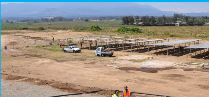
A view of a Dayliff solar array in Arusha, Tanzania.

D&S Tanzania under MD Benjamin Munyao has recently successfully completed a large and complex water supply project for international NGO Water Aid in Arusha, Northern Tanzania. The system, which pumps and purifies ground water using solar-hybrid power , was designed in-house by the D&S HO Projects department and consists of several large Dayliff DS submersible pumps that supply water to two Dayliff Reverse Osmosis water treatment plants producing 60m 3 /hr of pure water. The installation is powered by hybridized diesel and solar sources from Dayliff solar modules and gensets that are blended and conditioned by an SMA inverter and power control system. The equipment, which is now fully operational, is supplying clean water to the local water authority for distribution to the municipality and local communities.