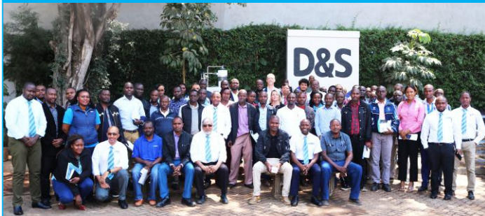
DuPont is one of the world's largest chemical companies and recently merged with another D&S supplier, Dow chemicals to form an even larger entity. In order to explain the merger and new products a training was recently held for D&S staff at the HO Training Center. Pictured is the group with the Technical Director and D&S Water Treatment staff after the event.