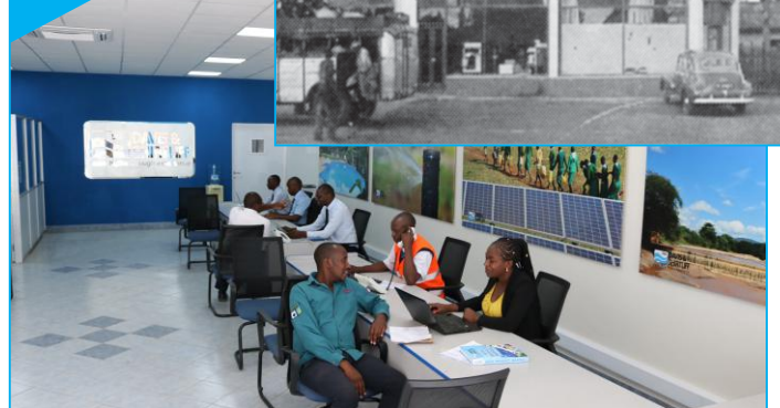
The new and old D&S premises at Westlands - about 100m and 73 years apart!