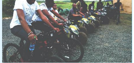
D&S Eastern Cluster