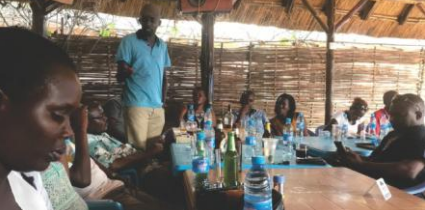
D&S S. Sudan