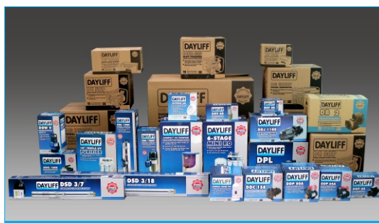
A selection of the digitally integrated Dayliff range of products

customers unrivalled choice, availability, value and support from the D&S Group. Now featuring over forty-five distinct product groups, well packaged Dayliff products occupy market leading positions in all the company's segments of activity including surface and submersible pumps, solar solutions, water treatment, swimming pools, power generation and irrigation items. With a particular focus