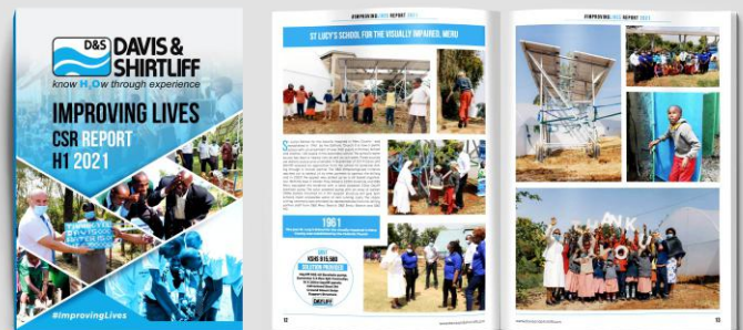
A view of the recently released 2021 H1 #ImprovingLives Report.