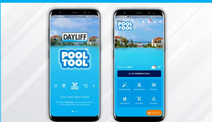
A view of the home screen of the new Dayliff Pool Tool smartphone App, available now for free download.

The D&S Group is pleased to announce its latest digital innovation, the Dayliff Pool Tool , a free for download smartphone app available from the Google Play Store and iOS App Store . Designed as a comprehensive support solution for all swimming pool owners and operators, the Dayliff Pool Tool offers a unique interface through which users can access a wide range of services including advice on pool design and maintenance, troubleshooting, e-shop, how to videos and chat support . Particularly innovative features are automated water diagnosis with chemical dosage calculator, live weather information and reminders for dosage and maintenance . Integrated into the D&S digital network, the App allows users to plug into real time product and service support to ensure that every pool remains in sparkling condition always.