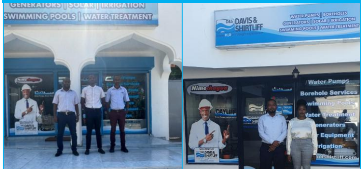
Newly opened branches at Malindi and Watamu are pictured with branch staff.