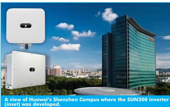
A view of Huawei's Shenzhen Campus where the SUN200 inverter (inset) was developed.

Headquartered in China's digital tech capital Shenzhen, Huawei is a global telcom and technology mega corporate with sales of $100 Billion and over 200,000 employees. Although principally known as the world's largest producer of smart phones, the company has a diversified portfolio of digital and electronic products including the recently introduced range of smart grid solar PV inverters which the D&S group now offers in all its markets.