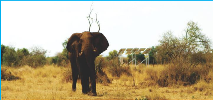
A large tusker is pictured in front the Dayliff Sunverter3 solar pumping system installed at Selenkay Conservancy.