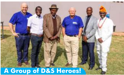
A Group of D&S Heroes!