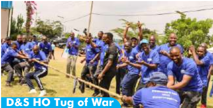
D&S HO Tug of War