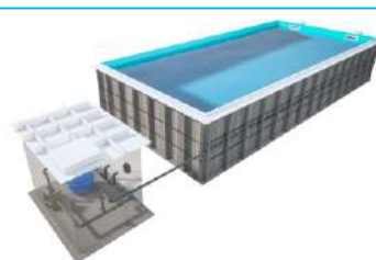
Slimline Packaged Swimming Pool