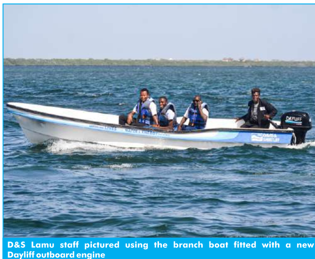
D&S Lamu staff pictured using the branch boat fitted with a new Dayliff outboard engine

These new products are sourced from a large Far Eastern factory that