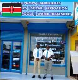
D&S Kangundo Rd