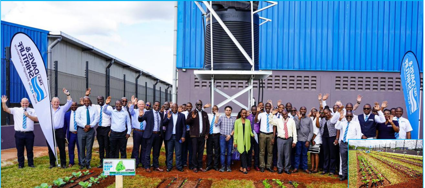
The DAYLIPA development teams from D&S Group and 4RDigital are pictured with guests at the investor briefing at the Tatu distribution centre.