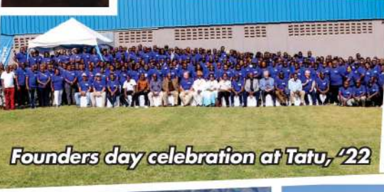
Founders day celebration at Tatu, '22