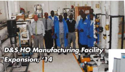
D&S HO Manufacturing Facility Expansion, '14