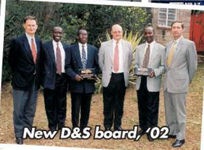
New D&S board, '02