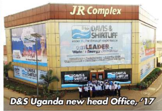
D&S Uganda new head Office, '17