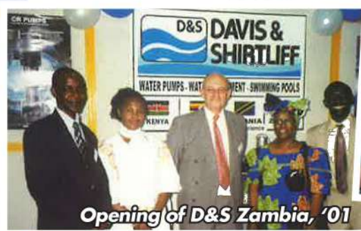
Opening of D&S Zambia, '01