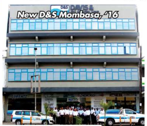
New D&S Mombasa, '16