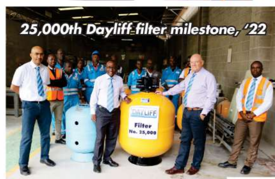
25,000th Dayliff filter milestone, '22