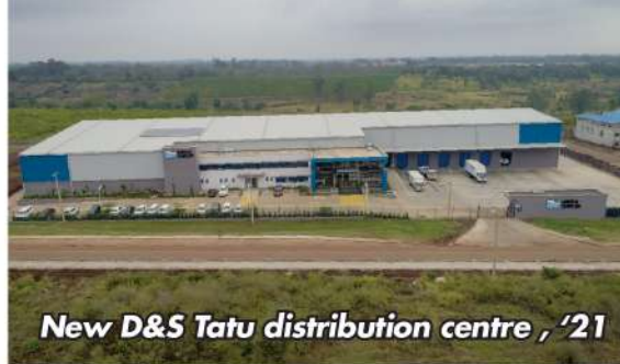
New D&S Tatu distribution centre, '21