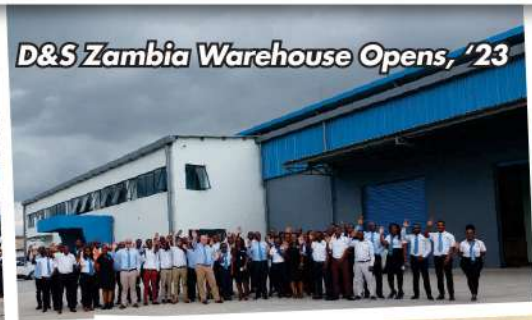
D&S Zambia Warehouse Opens, '23