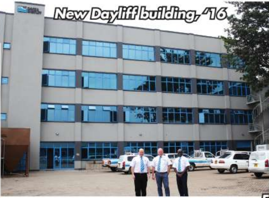
New Dayliff building, '16