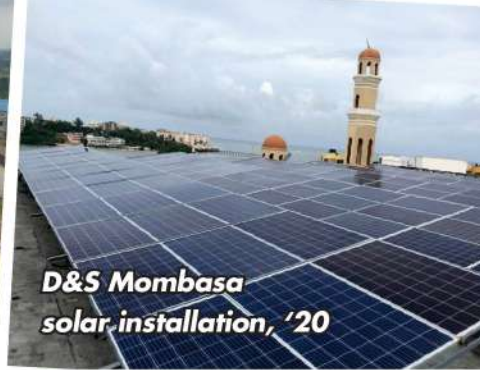
D&S Mombasa solar installation, '20