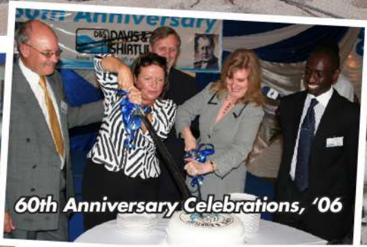
60th Anniversary Celebrations, '06