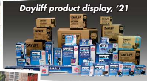
Dayliff product display, '21