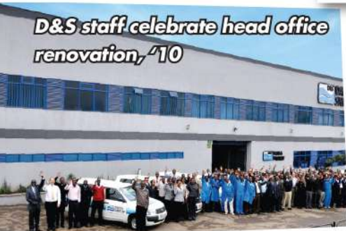
D&S staff celebrate head office renovation, '10