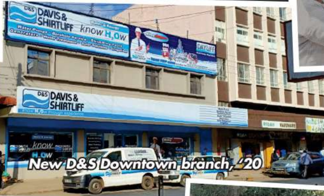
New D&S Downtown branch, '20