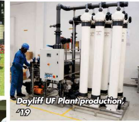
Dayliff UF Plant production, '19