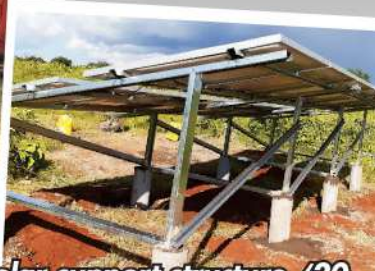
Solar support structure, '20