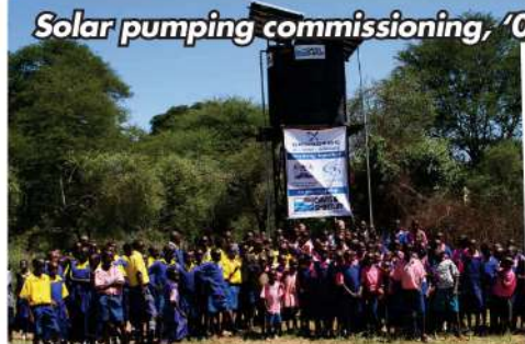
Solar pumping commissioning, '06