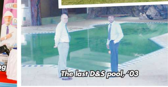
The last D&S pool, '03