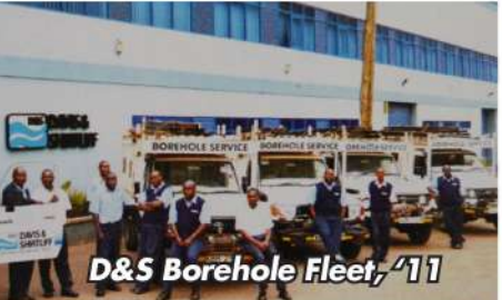
D&S Borehole Fleet, '11