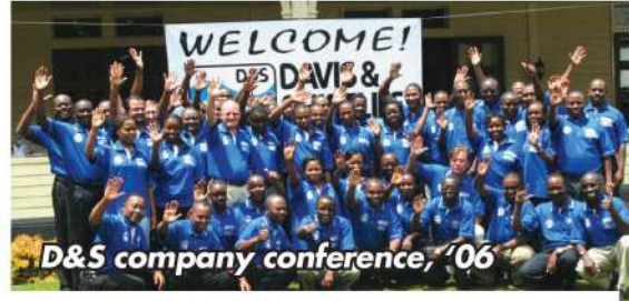
D&S company conference, '06