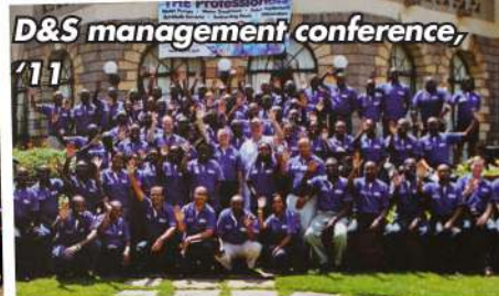
D&S management conference, '11