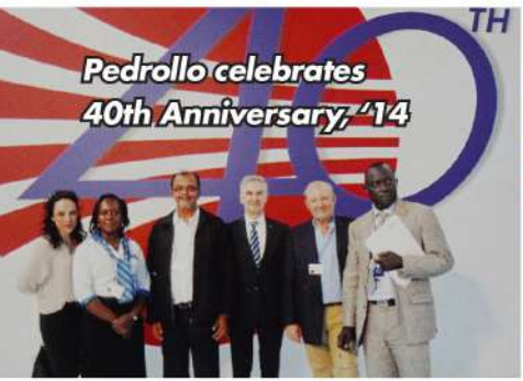
Pedrollo celebrates 40th Anniversary, '14