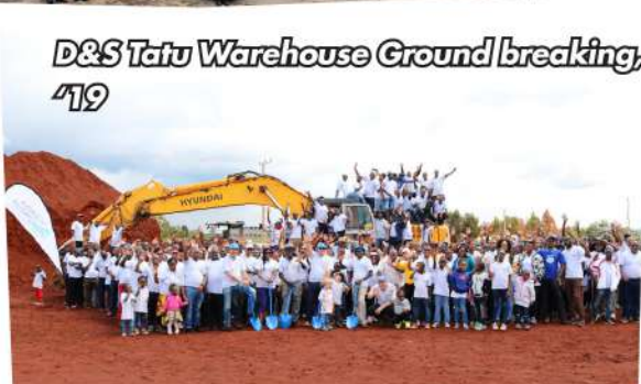
D&S Tatu Warehouse Ground breaking, '19