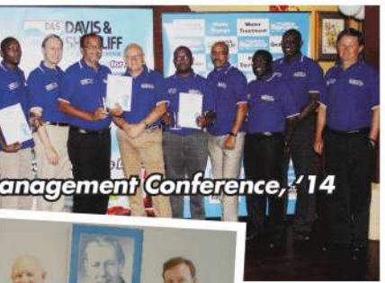
Management Conference, '14