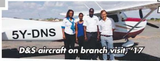
5Y-DNS D&S aircraft on branch visit, '17